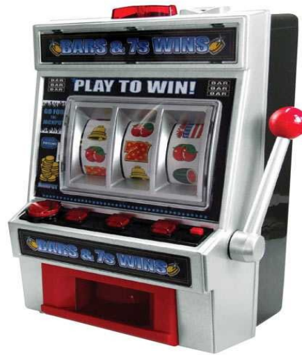
Figure 1: Slot Machine [1]

Slot machines are the most popular casino game in Las Vegas. The machine has three identical reels in a row with pictures on them that rotate when a lever is pulled (see Figure 1). It is a one-player game in which the player wins money based on the pattern of pictures shown when the reels stop. A player inserts coins or tokens, which represent money, in order to place a bet. After the bet is made, the player can then pull the lever down to make the reels spin. The reels spin faster or slower, in a random fashion, based on the force of the pull-down of the lever, and the payout is directly proportional to the amount of the bet placed. The ultimate goal of the game is to make all three reels show the same pictures, because then the player wins a large amount of money.